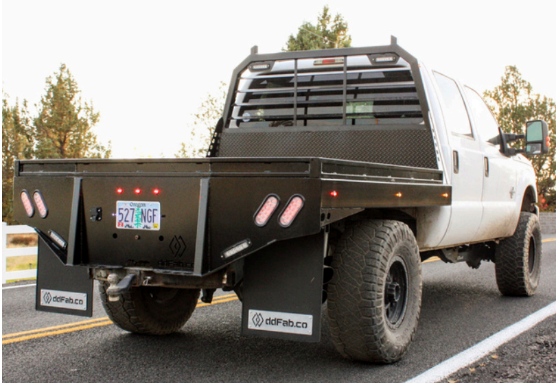
Shown: Standard Flatbed + Bed Rails + Cargo Ears

Transparent, all in pricing: Our prices include everything needed to go to work including installation.